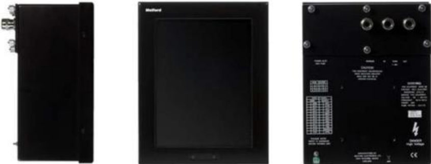
RT 248 12"